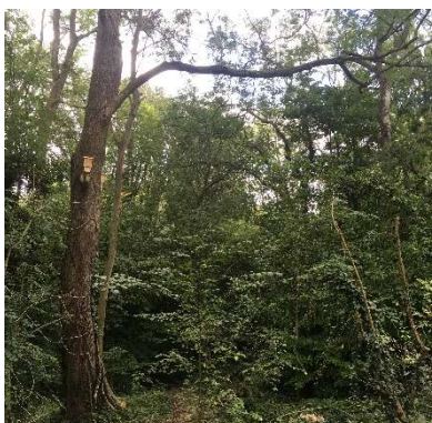
Various habitat boxes are being supplied as kits for installation at specific sites under the Borough Council's 'Green Guarantee' scheme.